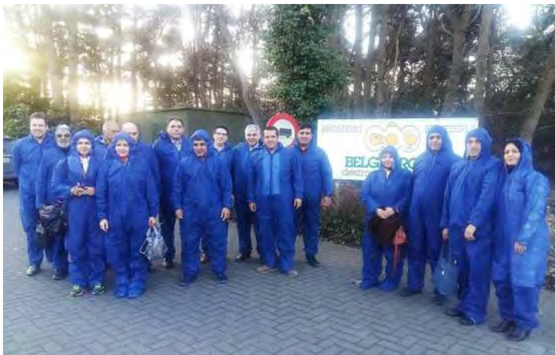
Visit to Belgabroed hatchery – Merksplas- Belgium- February 15 th 2017

پژواک پژوهش ایده کاوش (سهامی خاص) Research & Innovation Co.