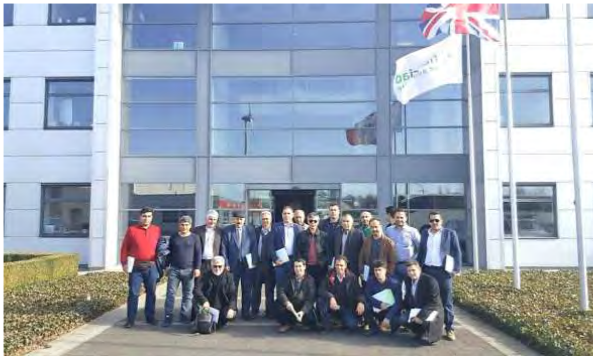
Visit to INVE België Company – Dendermonde – Belgium- February 15 th 2107

Technology Units Incubator, Shahid Beheshti University, Daneshjoo St., Velenjak, Tehran, IRAN. Post Code: 1983963113 Tel: +98(21)22419445 Fax: +98(21)22419445 Web Site: www.pezhvac.com E-mail: info@pezhvac.com Reg. Code.:462000 National code:14004474063