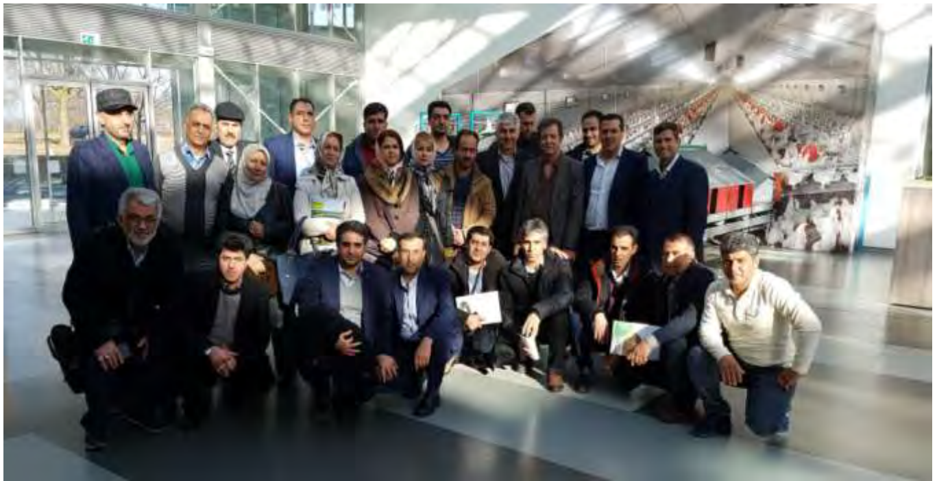
Visit to Venco Campus of Vencomatisgroup- Eersel- Netherlands- February 14 th 2017

Technology Units Incubator, Shahid Beheshti University, Daneshjoo St., Velenjak, Tehran, IRAN. Post Code: 1983963113 Tel: +98(21)22419445 Fax: +98(21)22419445 Web Site: www.pezhvac.com E-mail: info@pezhvac.com Reg. Code.:462000 National code:14004474063