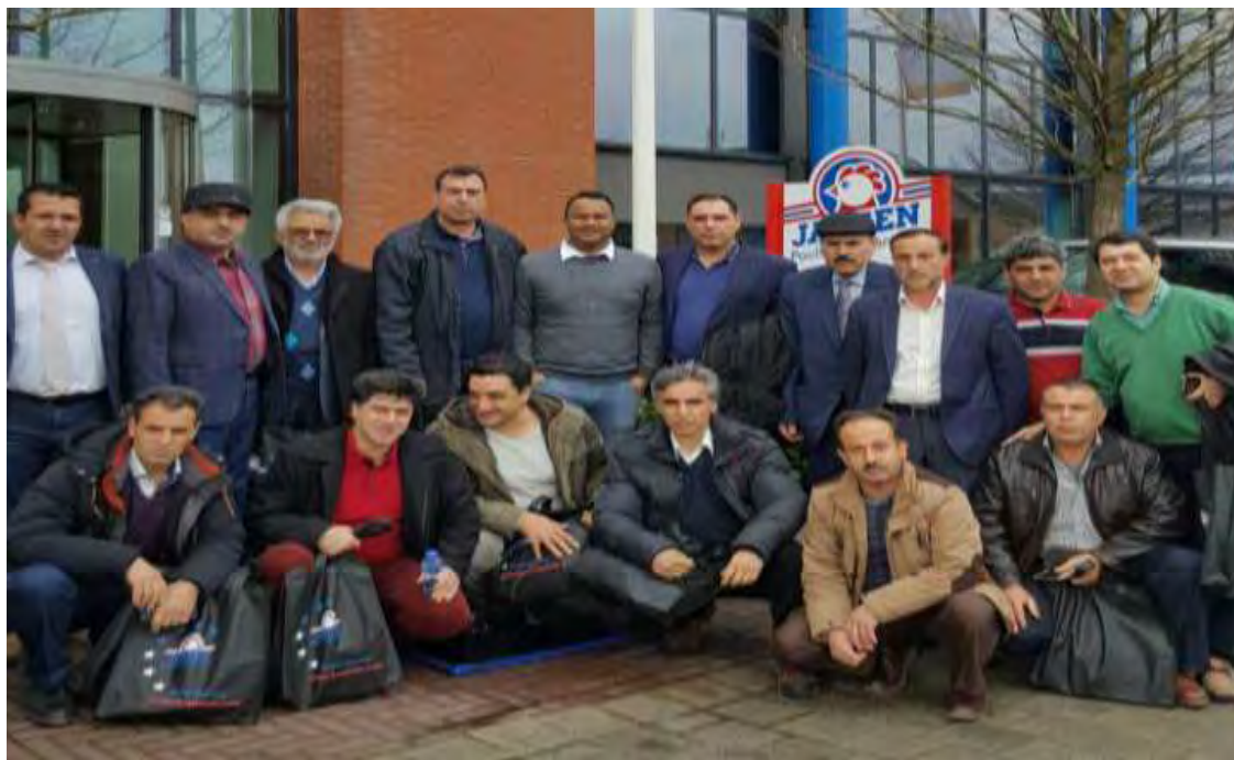
Visit to Jonsen Poultry Equipment company –Barneveld- Netherlands- February 17 th 2017