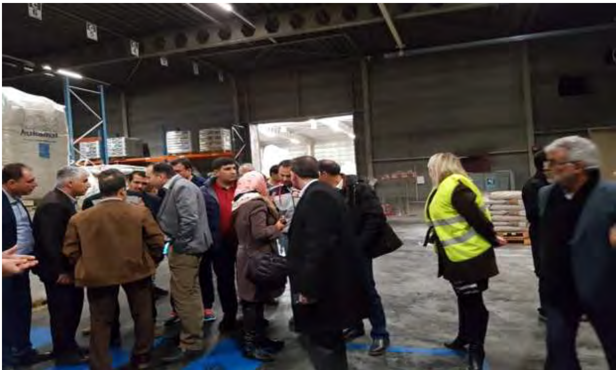
Visit to Nukamel production line- Weert- Netherlands- February 16 th 2017

Technology Units Incubator, Shahid Beheshti University, Daneshjoo St., Velenjak, Tehran, IRAN. Post Code: 1983963113 Tel: +98(21)22419445 Fax: +98(21)22419445 Web Site: www.pezhvac.com E-mail: info@pezhvac.com Reg. Code.:462000 National code:14004474063