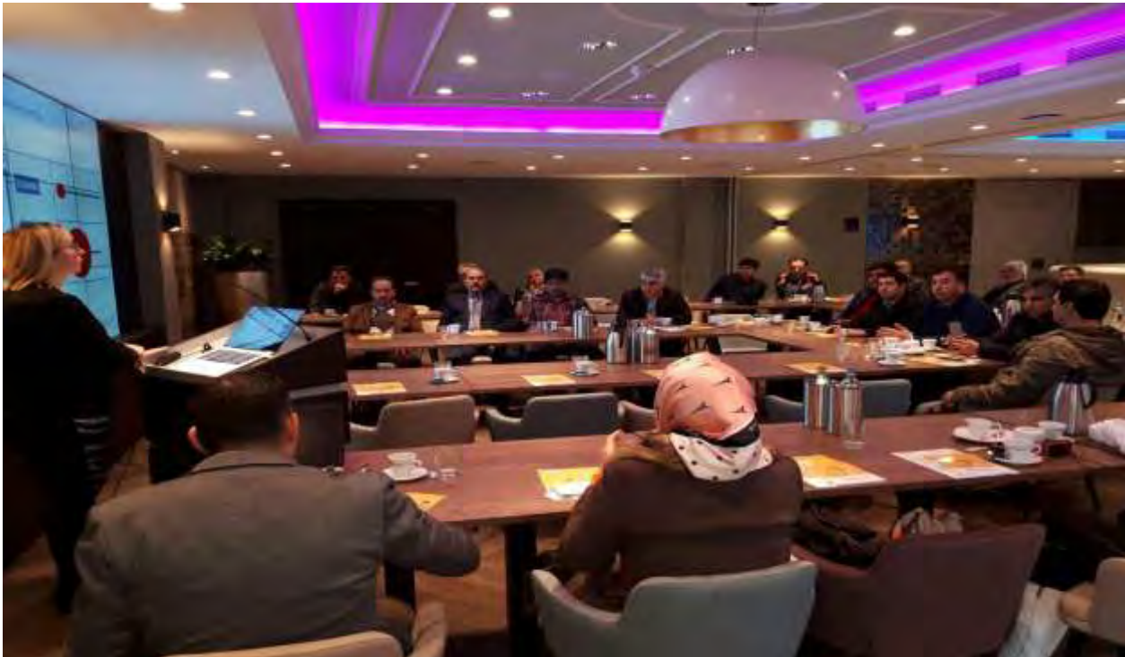
Presentation and question and answer meeting- Weert- Netherlands- February 16 th 2017

پژواک پژوهش ایده کاوش (سهامی خاص) Research & Innovation Co.