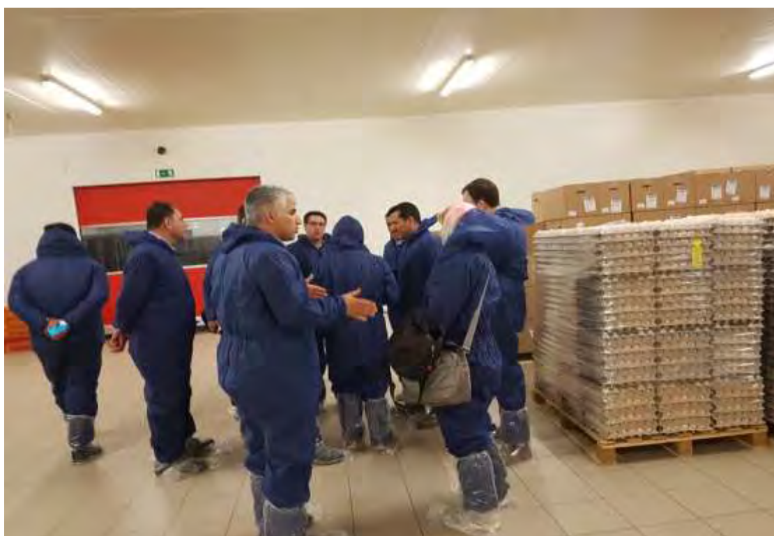
Visit to Belgabroed hatchery – Merksplas- Belgium- February 15 th 2017

Technology Units Incubator, Shahid Beheshti University, Daneshjoo St., Velenjak, Tehran, IRAN. Post Code: 1983963113 Tel: +98(21)22419445 Fax: +98(21)22419445 Web Site: www.pezhvac.com E-mail: info@pezhvac.com Reg. Code.:462000 National code:14004474063