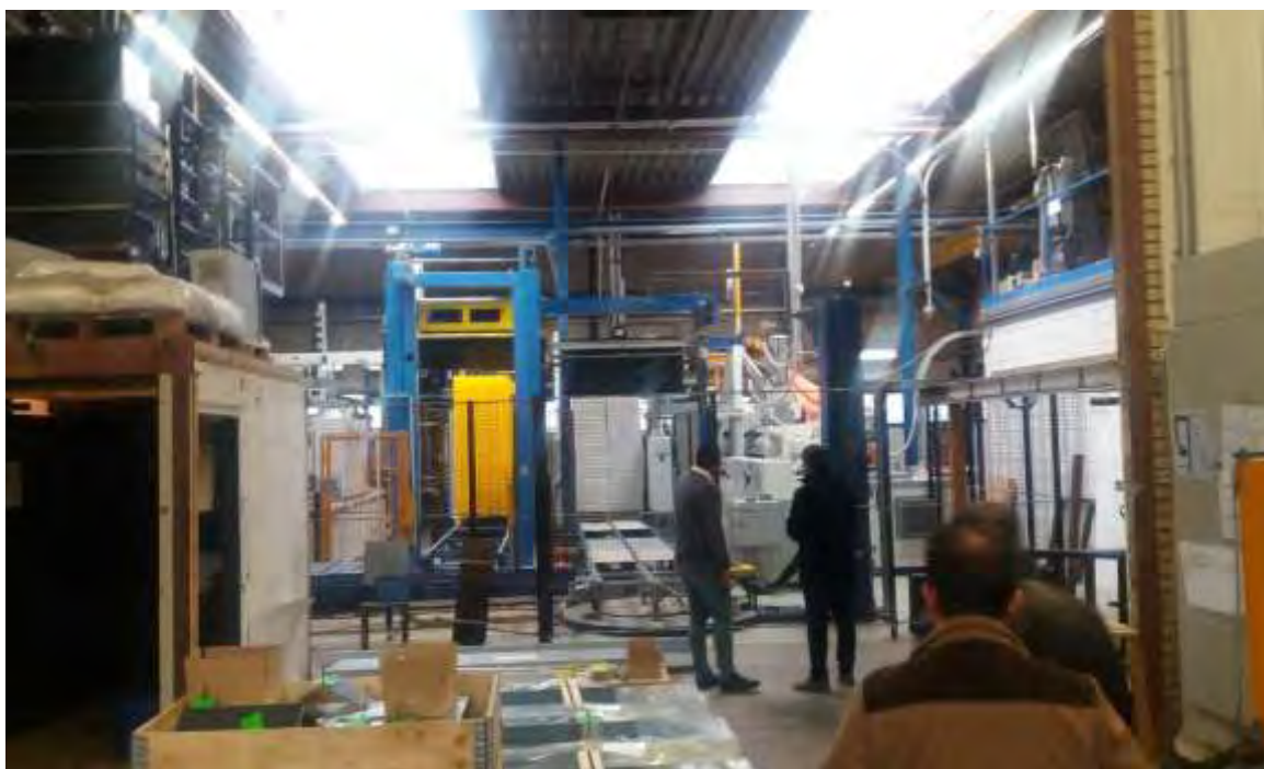
Visit to manufacturing line of Jonsen Poultry Equipment Site- Barneveld- Netherlands- February 17th 2017

Technology Units Incubator, Shahid Beheshti University, Daneshjoo St., Velenjak, Tehran, IRAN. Post Code: 1983963113 Tel: +98(21)22419445 Fax: +98(21)22419445 Web Site: www.pezhvac.com E-mail: info@pezhvac.com Reg. Code.:462000 National code:14004474063