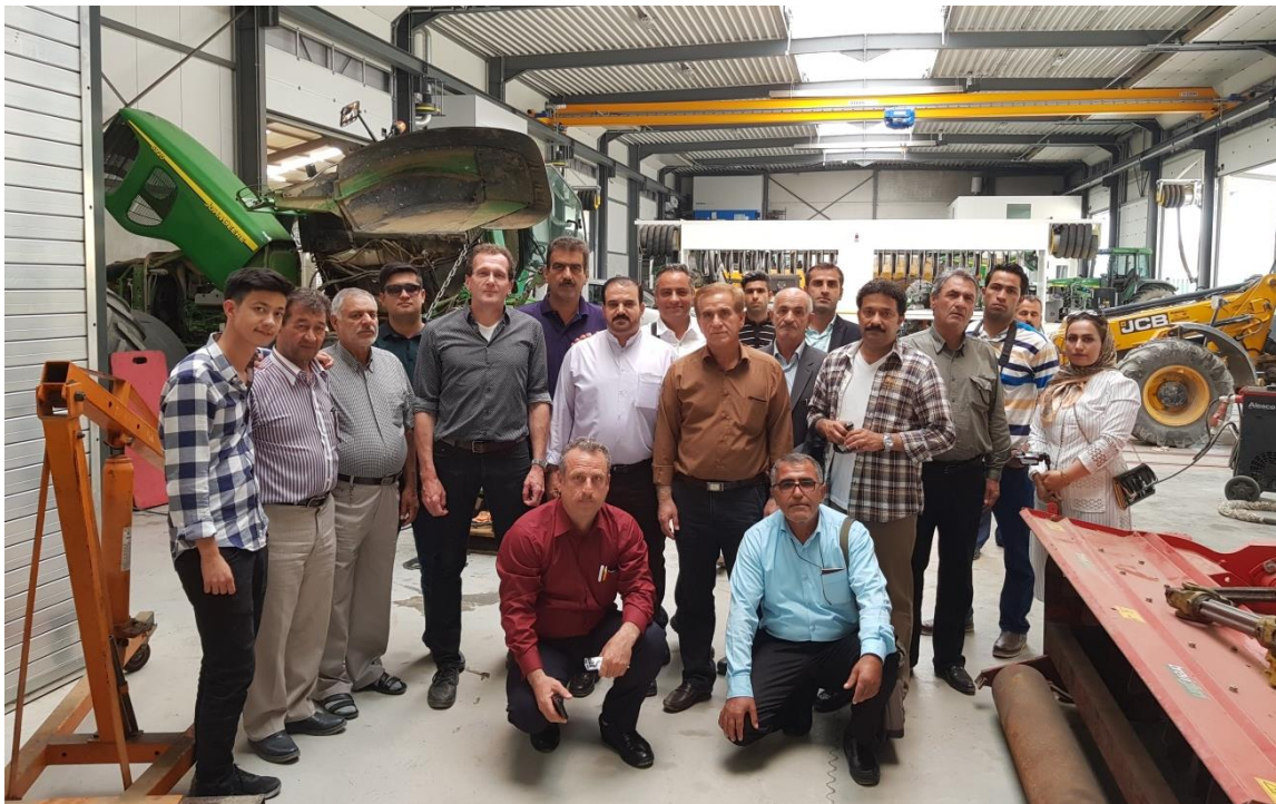
Visiting the company's workshop and equipment to be used for repair and customers' desired modifications