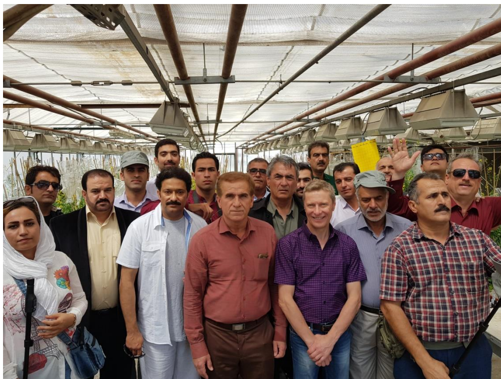
Visiting breeding activities in Rapeseed greenhouse