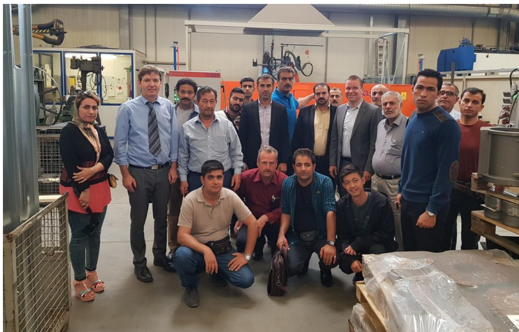
Factory Tour including machineries and equipment, welding robot, cutting and punching machine, etc.