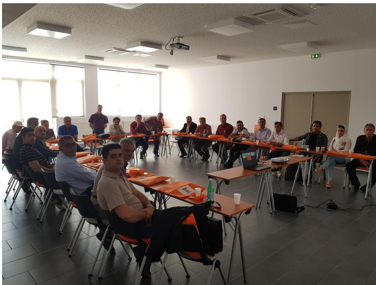
Giving primary presentation of the company, its history and performance in seed production, breeding and marketing