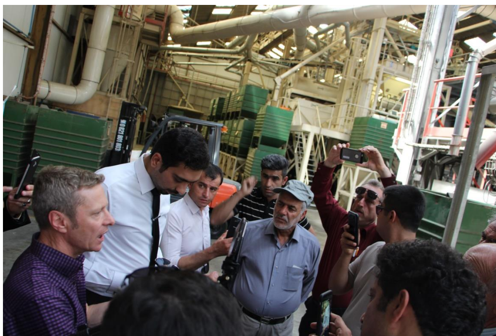
Visiting the plant, including machineries and equipment for processing and packing the seeds.