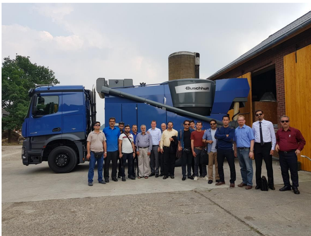
Visiting farm and mobile milling and mixing plant used for producing feed