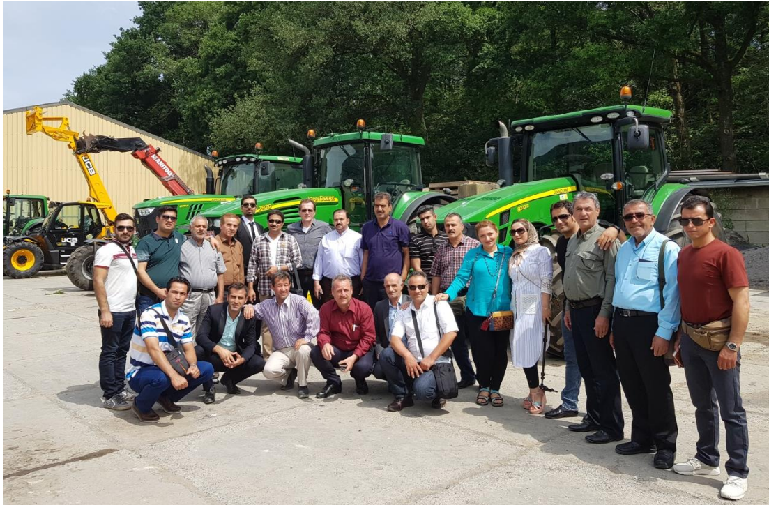
Visiting different types of machinery and equipment in the company while holding enquiry session about them