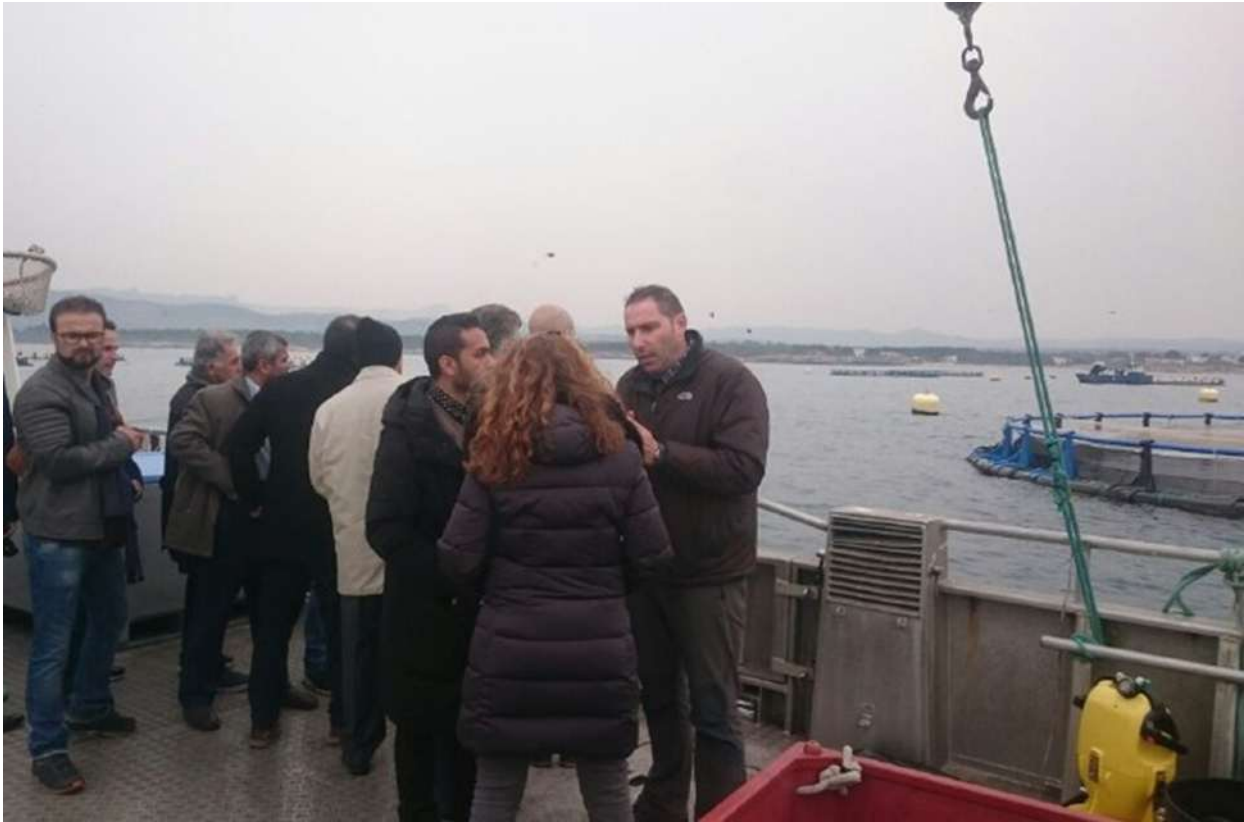
Visit to Invermar cage aquaculture farm in Tarragona, Spain, February 23 rd 2017