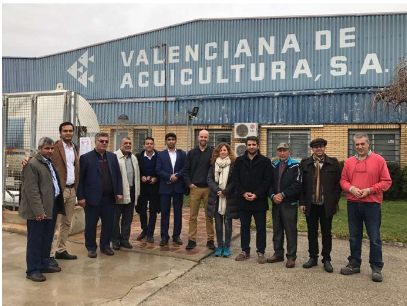
Visit to Valaqua farm with RAS, Valencia, Spain, February 24 th 2017

Technology Units Incubator, Shahid Beheshti University, Daneshjoo St., Velenjak, Tehran, IRAN. Post Code: 1983963113 Tel: +98(21)22419445 Fax: +98(21)22419445 Web Site: www.pezhvac.com E-mail: info@pezhvac.com Reg. Code.:462000 National code:14004474063