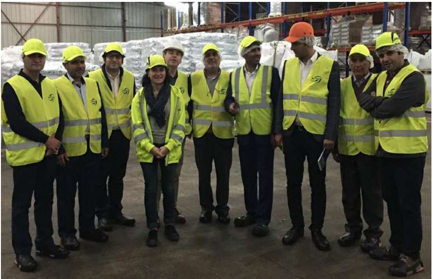
Visit to Biomar Feed production line in its factory, Nersac, France- February 20th 2017