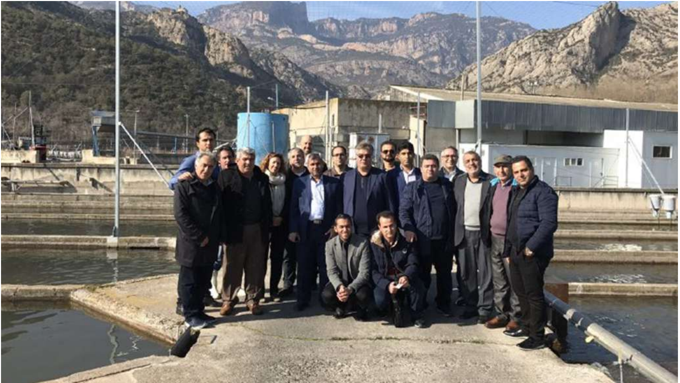
Visit to Truchasdelsegre Trout farm, Lleida, Spain, February 22 nd 2017