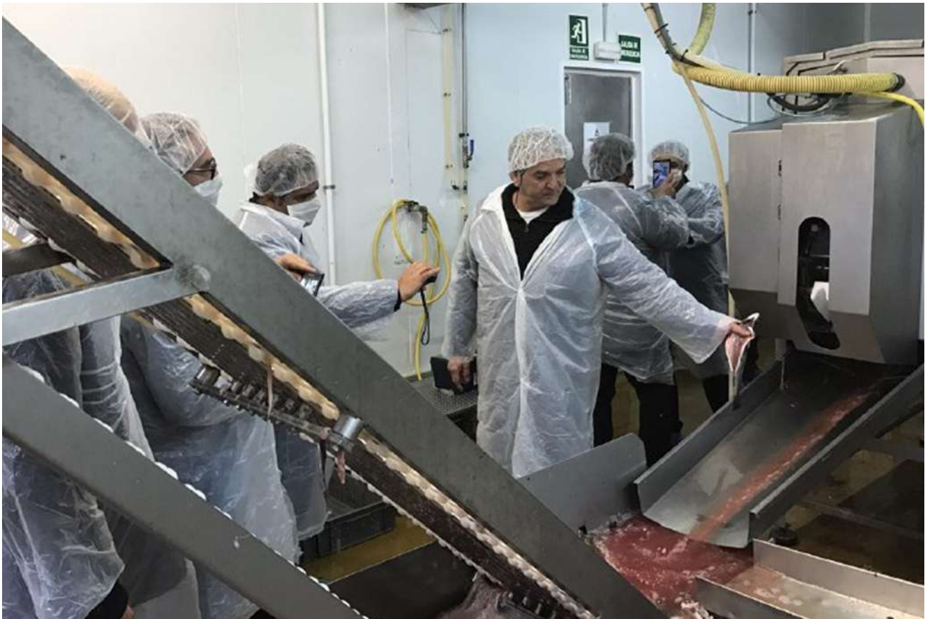
Visit to Truchasdelsegre processing site, Lleida, Spain, February 22 nd 2017