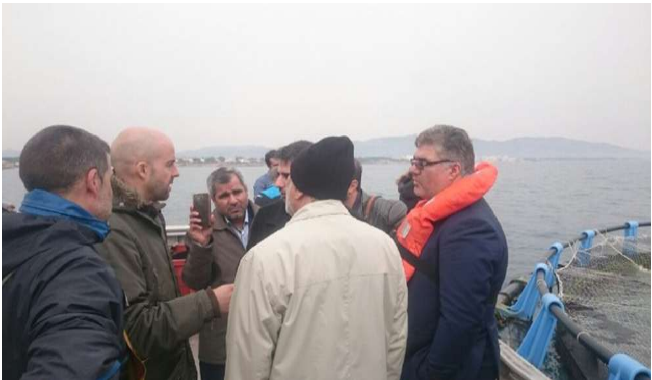
Visit to Invermar cage aquaculture farm in Tarragona, Spain, February 23 rd 2017