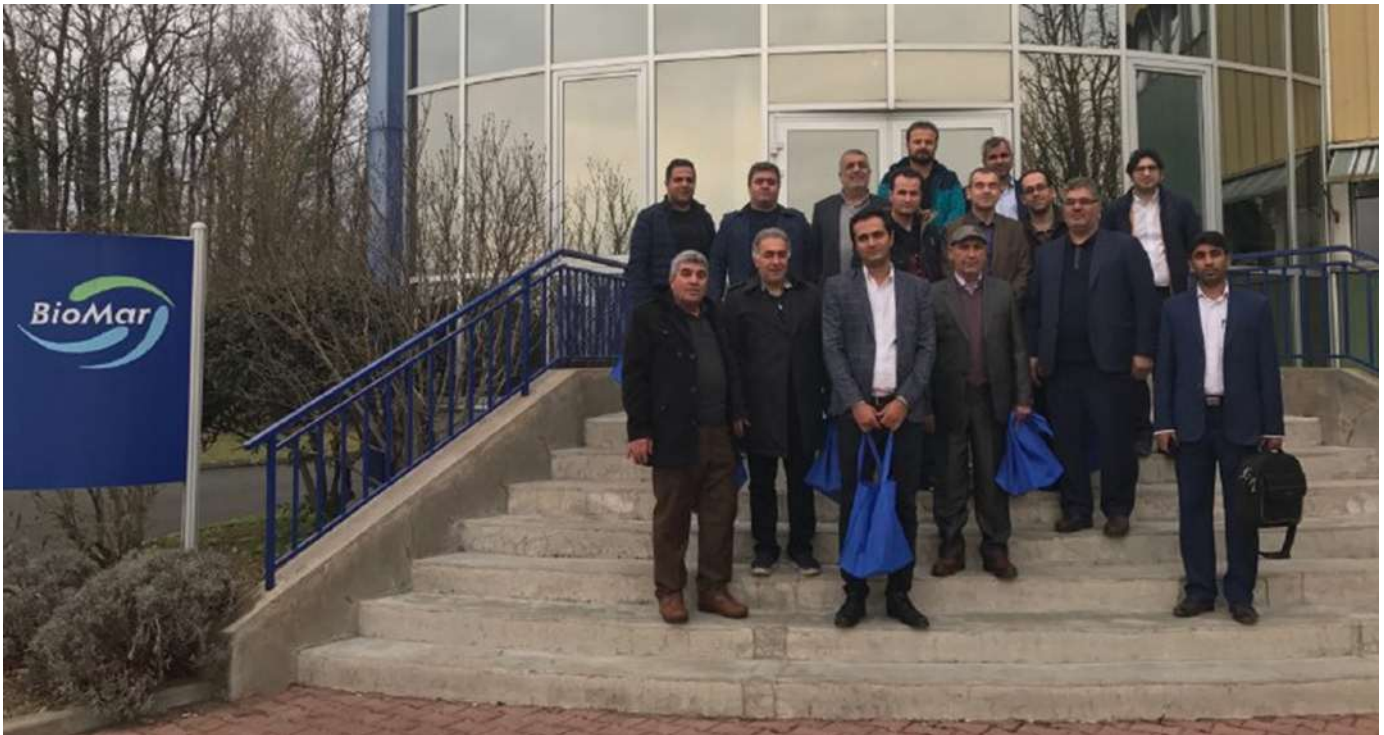
Visit to Biomar Company, Aquaculture feed company, Nersac, France- February 20th 2017

Technology Units Incubator, Shahid Beheshti University, Daneshjoo St., Velenjak, Tehran, IRAN. Post Code: 1983963113 Tel: +98(21)22419445 Fax: +98(21)22419445 Web Site: www.pezhvac.com E-mail: info@pezhvac.com Reg. Code.:462000 National code:14004474063